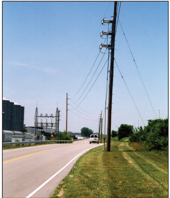
Powerline easement over a private road easement over a pipeline easement. Space is available for additional uses in the non-track area.

Mr. Rahn's clarification of the difference between the enhancement factor and the ATF (across the fence) value is partially correct. The argument that corridors have value greater than the land across the fence does reflect a belief in a synergistic effect created by a corridor. However, the base value, or ATF, of a corridor is itself based on the belief of a synergism in the assemblage of land pieces into a corridor. This synergism is expressed in the belief that once assembled, the corridor has a value at least equal to the land across the fence. Small, narrow pieces of land seldom have the same functional utility as typical lots in the area and therefore often reflect a lower market price. But when combined to create a corridor, they may have greater functional use, depending on market conditions. This is an assumption that is almost never disclosed to readers of appraisal reports of railroad corridors and when not disclosed, I believe, constitutes a violation of professional standards. Uniform Standards of Professional Appraisal Practice (USPAP) require that hypothetical conditions and major assumptions which impact the valuation of a property must be disclosed.